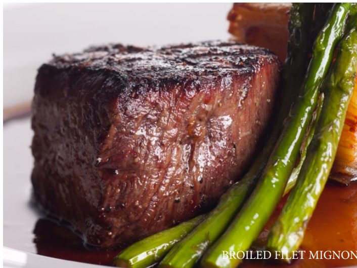
BROILED FILET MIGNON