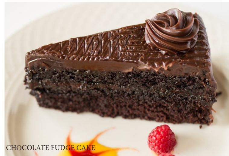
CHOCOLATE FUDGE CAKE

Mascarpone Cream Layered Between Espresso & Rum Dipped Ladyfingers Sprinkled with Chocolate