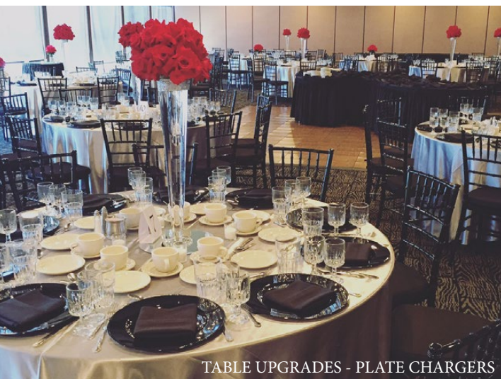
TABLE UPGRADES - PLATE CHARGERS